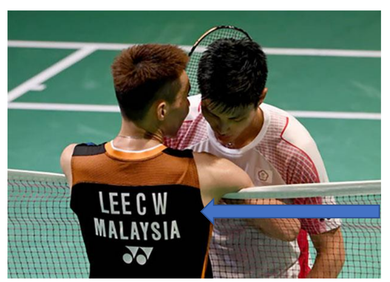
Player Name is MANDATORY for the Dubai Junior International Series 2018

Order of lettering: - Player Name (mandatory for this event), Country (if present) and Advt. (if present). Lettering: must be in Capital letters, horizontal, on top of the shirt, single color, contrast with the color of the shirt. If there is a pattern on the back of the shirt, the lettering should be on a contrasting panel. Player name: Must be the last